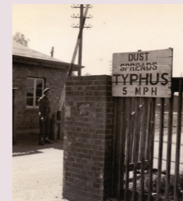
THE OXFORDSHIRE YEOMANRY AT THE LIBERATION OF BERGEN-BELSEN CONCENTRATION CAMP