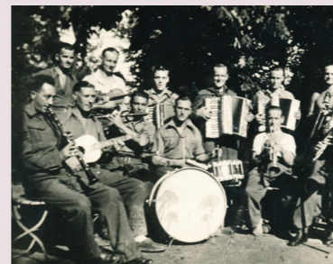
PRISONERS OF WAR AT HOME AND ABROAD