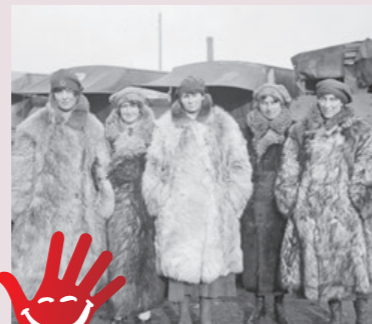
THE SECRET WAR