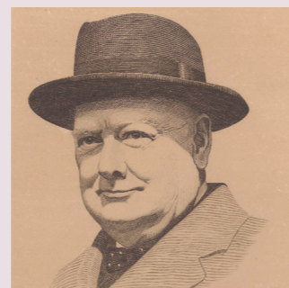
CHURCHILL AND THE QUEENS OWN OXFORDSHIRE HUSSARS