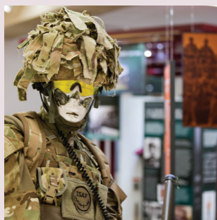
MODERN CONFLICT 21ST CENTURY SOLDIER