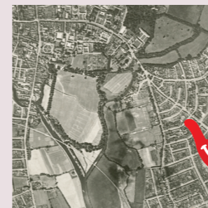
AIRPOWER, THE AIRMEN AND AIRFIELDS OF OXFORDSHIRE