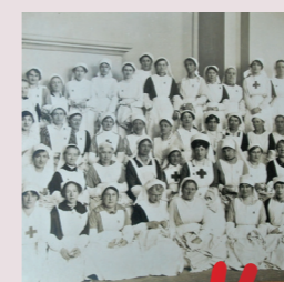
BLOOD & WAR, LIFE ON THE FRONT LINE