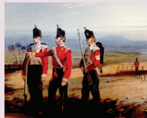
BATTLES, THE OXFORDSHIRE AND BUCKINGHAMSHIRE LIGHT INFANTRY